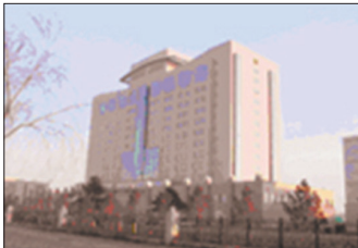
A general view of the Changchun Institute of Optics, Fine Mechanics and Physics (CIOMP), where ICO-20 will be held on 22–26 August.