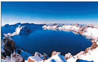
A spectacular view of the Changbaishan Mountain ("Ever White" in Chinese) located in the Jinlin province of China.

The 20th Congress of ICO will meet in Changchun, China, on 21–26 August 2005. This traditional Congress in optics started 57 years ago. Indeed, the first official meeting of ICO took place in Delft, the Netherlands, on 12–17 July 1948, at the Physics Laboratory of the Delft Technische Hogeschool. Forty-four delegates from 11 countries attended the meeting.